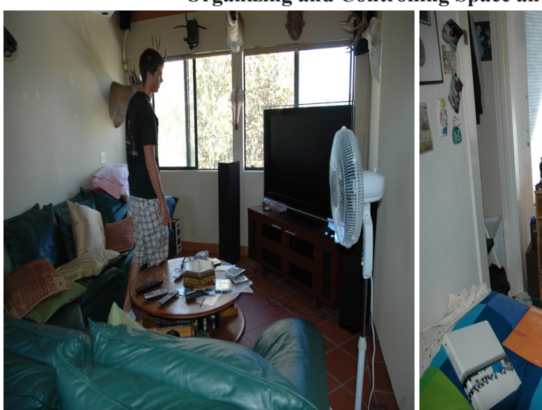
Organizing and Controlling Space and Time