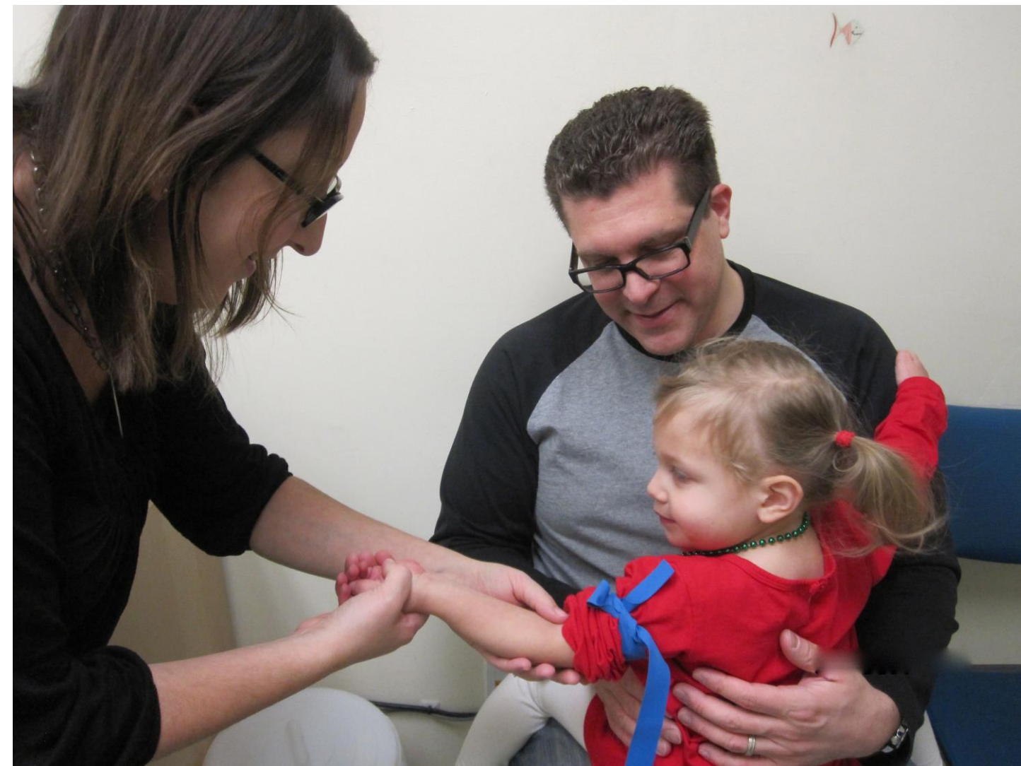
Example of comfort positioning during blood draw