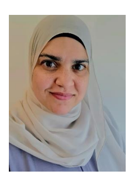
Fida Nasr Abou Hamda Project analysis For Islamic Studies Programs